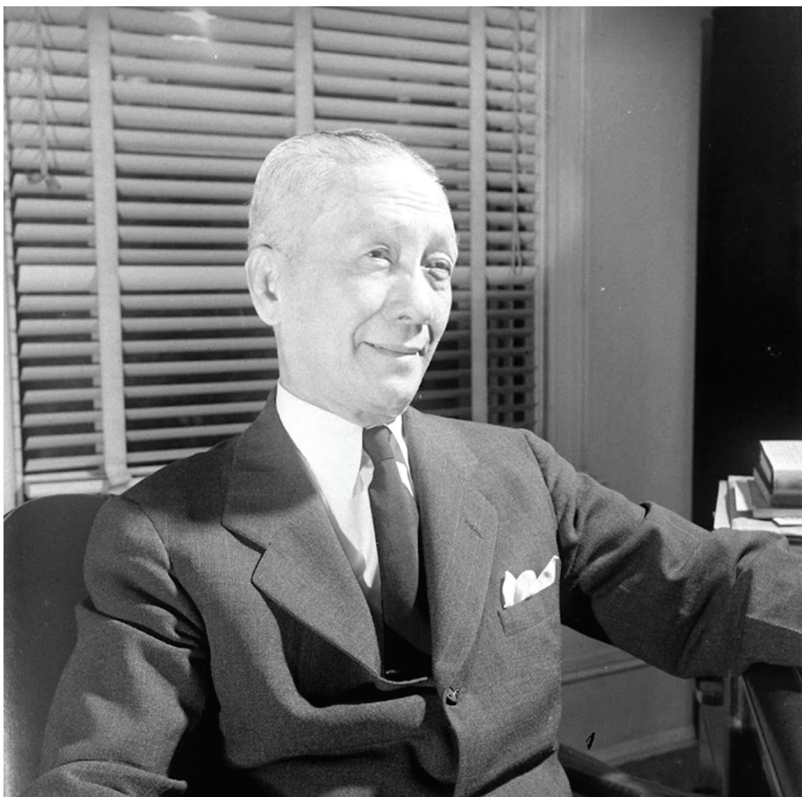
Photo of President Sergio Osmeña in his office in Washington D.C., 1944